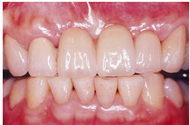
Fig. 15. This metal-ceramic fixed partial denture essentially duplicates the aesthetic result achieved with the provisional restoration in Fig. 14.