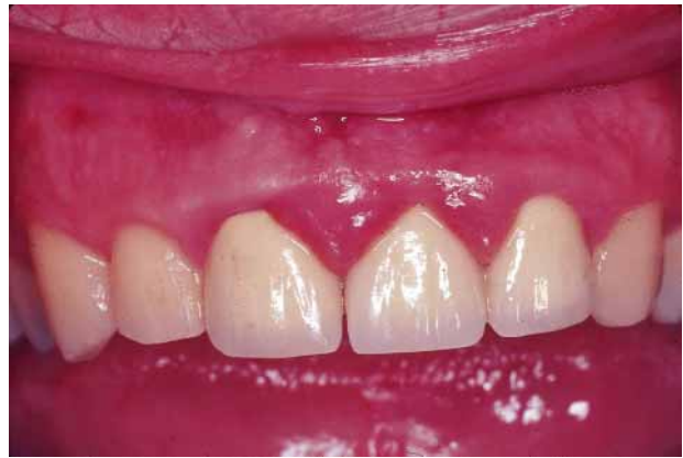
Fig. 10. These restorations are overcontoured due to inadequate tooth preparation, and the chronic inflammatory response is due to biological width violation.

the situations in which restorative margins are to be placed in the gingival sulcus and are intended to be hidden by healthy gingival tissues, the goal is to maintain tissue health and at the same time prevent recession and subsequent exposure of the restorative margin (Fig. 7, 8). The second problem is to place the restoration deep enough in the sulcus to avoid detection and at the same time keep the margin an appropriate distance from the attachment or crest of the alveolar bone so that biological width is not violated (Fig. 9–11) (24, 26, 41).