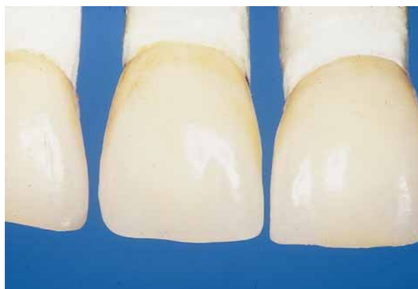
Fig. 2. These anterior crowns with all-porcelain labial margins demonstrate excellent aesthetics in the cervical third of the restorations.