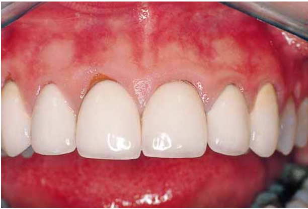
Fig. 8. These anterior restorations have failed due to mediocre laboratory support and recession due to improper soft tissue management.