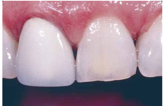
Fig. 5. This metal-ceramic crown is an aesthetic failure due to under-preparation and poor soft tissue management.

This chapter discusses the essentials of soft tissue management inherent in intracrevicular restorative dentistry related to anterior teeth. The clinician faces two basic problems with soft tissue management. In