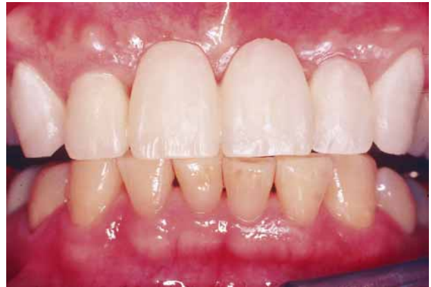
Fig. 14. An acrylic resin provisional restoration has replaced the fixed partial denture in Fig. 13 and will act as the blueprint for the definitive restoration.

While both oral hygiene and cervical margin design may be causative factors for gingivitis, the primary causative factor with chronic gingival inflam-