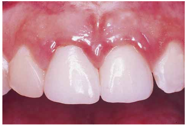
Fig. 16. Soft tissue management is equally as important with all-ceramic crowns as it is with metal-ceramic crowns. Note the biological width violation resulting from margins placed too deep in the gingival sulcus.

Given these recommendations for cervical margin placement, we believe that most finish lines are placed in a position that is too deep into the sulcus. It is likely that the cause of chronic inflammation around the majority of anterior restorations is biological width violation due to the location of the margins relative to the attachment. The major error made by many clinicians is the failure to follow the anatomic sculpting of the tissues and alveolar bone, especially in the interproximal area, and thus interproximal margins are placed too close to the attachment (Fig. 18, 19).