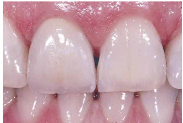
Fig. 6. The crown shown in Fig. 5 was replaced with a Captek restoration after the tooth was adequately prepared.