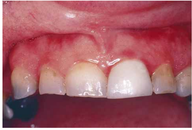
Fig. 9. This restoration has failed due to improper tooth preparation resulting in over-contour and opacity, and poor soft tissue management in the form of biological width violation.