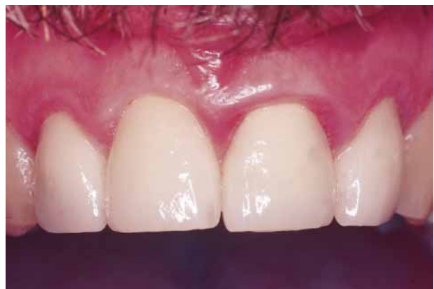
Fig. 18. The chronic inflammatory response around these anterior crowns is a result of margins placed too deeply in the sulcus.