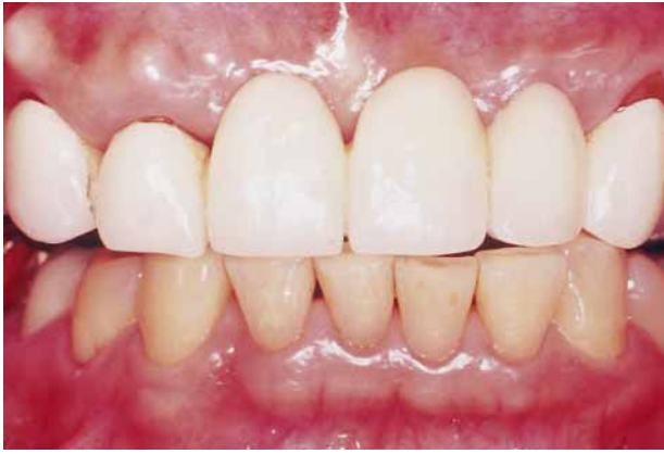
Fig. 13. This fixed partial denture is not acceptable due to recession of the gingival tissues.

procedure (58). It appears empirically that patients with thin, scalloped gingival tissues are more prone to recession than those with thick, flat tissues. This prolonged waiting period of 5 to 6 months would seem to be essential with the former type of patient. These patients will obviously be wearing provisional restorations for a prolonged period, and a recommended precautionary procedure is to remove and re-cement these provisional restorations approximately every 6 weeks to prevent leakage and subsequent recurrent caries.