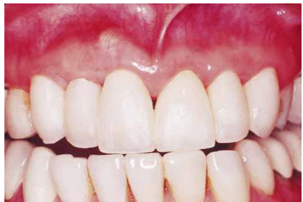
Fig. 21. After the appropriate periodontal therapy for the patient illustrated in Fig. 20, acrylic resin provisionals were fabricated and tested intraorally to develop optimum aesthetics.