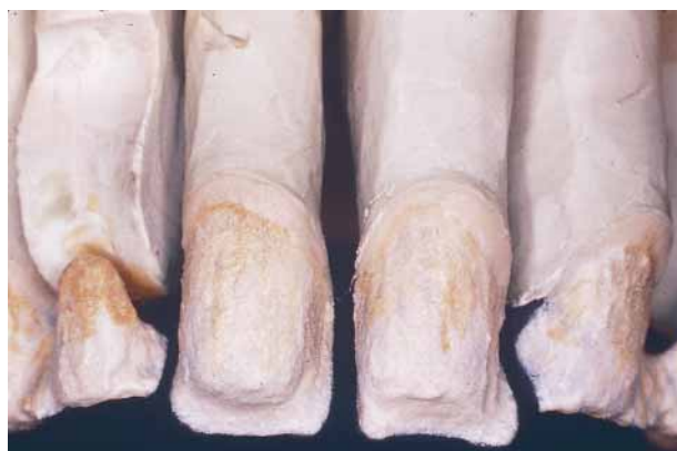
Fig. 1. The routine use of intrinsic coloration and all-porcelain labial margins has significantly improved the aesthetics of metal-ceramic restorations. Note the textured opaque that enhances light refraction.

However, it is equally clear that the clinical results achieved by most of the profession fall far short of