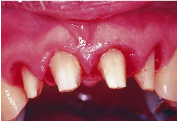
Fig. 19. After the crowns in Fig. 18 have been removed, it is clear the margins had been placed too deep into the sulcus. Crown lengthening will be required to move the attachment to a more apical position.

Most authorities recommend that, whenever possible, cervical margins should be placed in a supragingival location to obtain optimum soft-tissue health (52). Other advantages resulting from supragingival margins are ease of impression making and improved ability to evaluate the quality of the margins (11). With porcelain laminate veneer restorations, such an approach is recommended due to the inherent translucency of the veneers, which creates a “contact lens effect” and effectively blends the veneer imperceptibly into the cervical portion of the tooth (Fig. 3) (36).