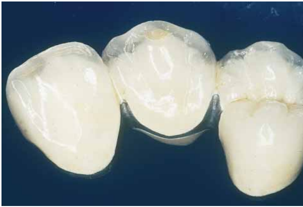
Fig. 4. With intrinsic coloration techniques and translucent body and incisal porcelains, natural aesthetics can be achieved with contemporary metal-ceramic restorations.

this lofty goal. Failure to obtain optimum results probably has less to do with the restorative medium chosen than it does with failure to adequately prepare the soft and hard tissues to receive the restorations (Fig. 5, 6) (8, 16). In order to achieve aesthetic and functional success with any and all of these modalities, it is imperative that the clinician first bring the gingival tissues to optimal health prior to definitive tooth preparation and maintain this state of health through the provisional stage (7, 13, 17). Finally the clinician must understand the nature of the restorative materials to be utilized and prepare the teeth adequately in the correct planes to provide sufficient room for the chosen materials. He or she must also accurately communicate the aesthetic treatment plan to a laboratory technician or cera-