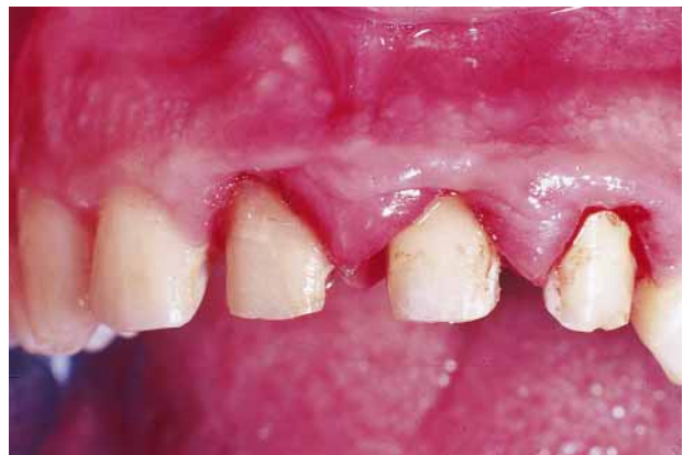
Fig. 11. After removal of the restorations in Fig. 10, the under-reduction of the teeth for metal-ceramic restorations is evident. Note that the cervical finish lines are located deep in the gingival crevice.

It is important to understand that gingival recession is not an inevitable consequence of aging but rather