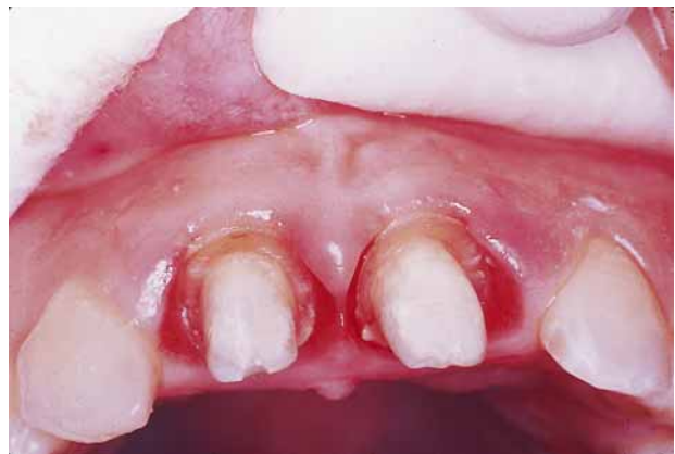
Fig. 17. The all-ceramic crowns in Fig. 16 have been removed. The cervical finish lines are too deep primarily in the inter-proximal areas, where the preparations have failed to follow the scalloped pattern of the soft tissues and underlying alveolar crest.