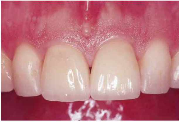
Fig. 3. Because of the contact lens effect, porcelain veneers can be placed with supragingival margins, thereby insuring an optimal periodontal response.