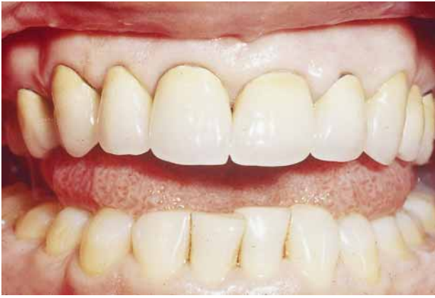
Fig. 7. These anterior teeth have been adequately prepared, but are aesthetic failures due to poor choice of margin geometry and recession due to poor soft tissue management.