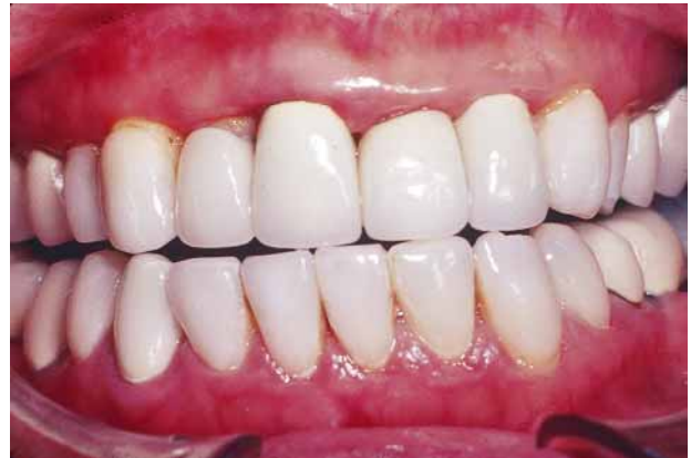
Fig. 20. These anterior restorations have several aesthetic deficiencies both in terms of the restorations themselves and the soft tissue management.

The many advances that have occurred in the field of fixed prosthodontics and ceramics allow fabrication of metal-ceramic and all-ceramic restorations that mimic nature and frequently deny detection. However, no matter how natural and lifelike such restorations may be, the final aesthetic result depends most on the health of the surrounding gingival tissues. The key to success is effective soft tissue