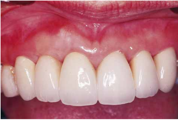
Fig. 22. The definitive restorations basically duplicate the aesthetic result achieved with the provisional restoration in Fig. 21.

management with the primary goal of healthy gingival tissues covering sound, smooth restorative margins.